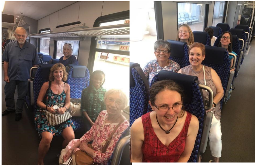
On the TEXRail train for the Earth Care Transportation Adventure in July!

Children and Youth will go to lunch together and then participate in a local fun activity that they vote on using a Survey Monkey poll.